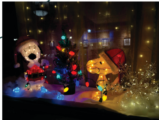
Left: OVB pixel tree at Gallipolis in Lights Above: Peanuts® light display at OVB on the Square in Gallipolis